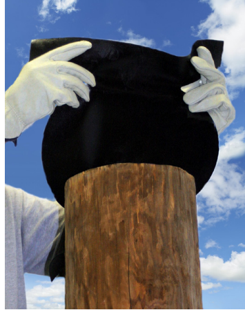
Step 2: Center and adhere to top