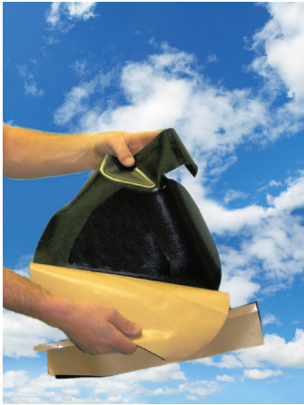
Step 1: Peel protective backing