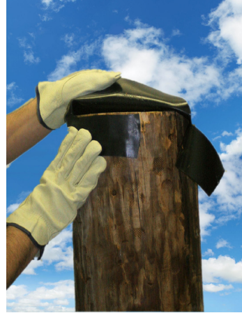
Step 3: Wrap tabs around pole and fold excess top over edges*